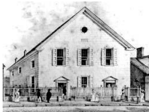
BETHEL A. M. E. CHURCH Philadelphia, Pennsylvania

Memory Verse "Remember that God brought you out of slavery" (paraphrased Exodus 13:3a)