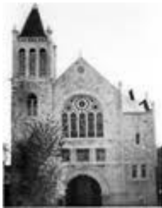
MOTHER BETHEL A. M. E. CHURCH Philadelphia, Pennsylvania