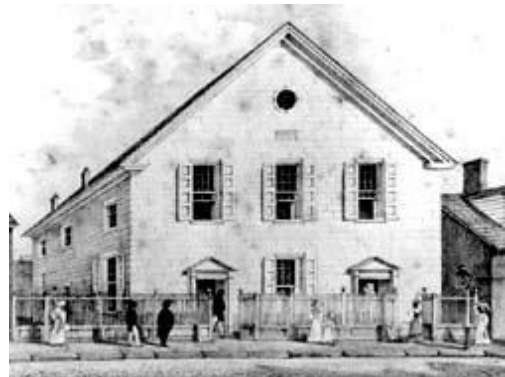
BETHEL A. M. E. CHURCH Philadelphia, Pennsylvania

“Remember that God brought you out of slavery” (paraphrased Exodus 13:3a)